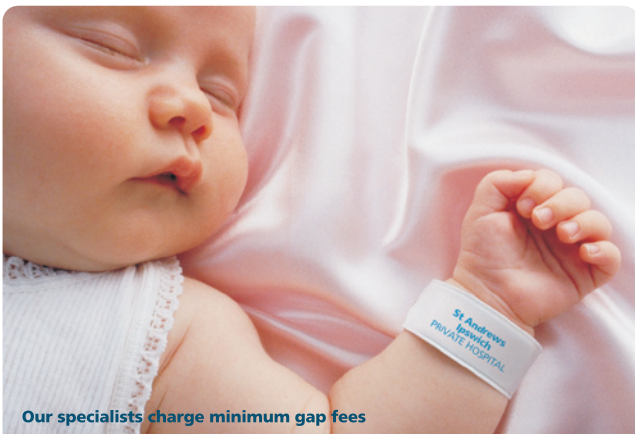
Our specialists charge minimum gap fees